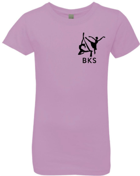
Youth Pink Princess Tee - $25