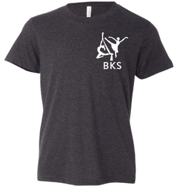
Youth Gray Tee - $25